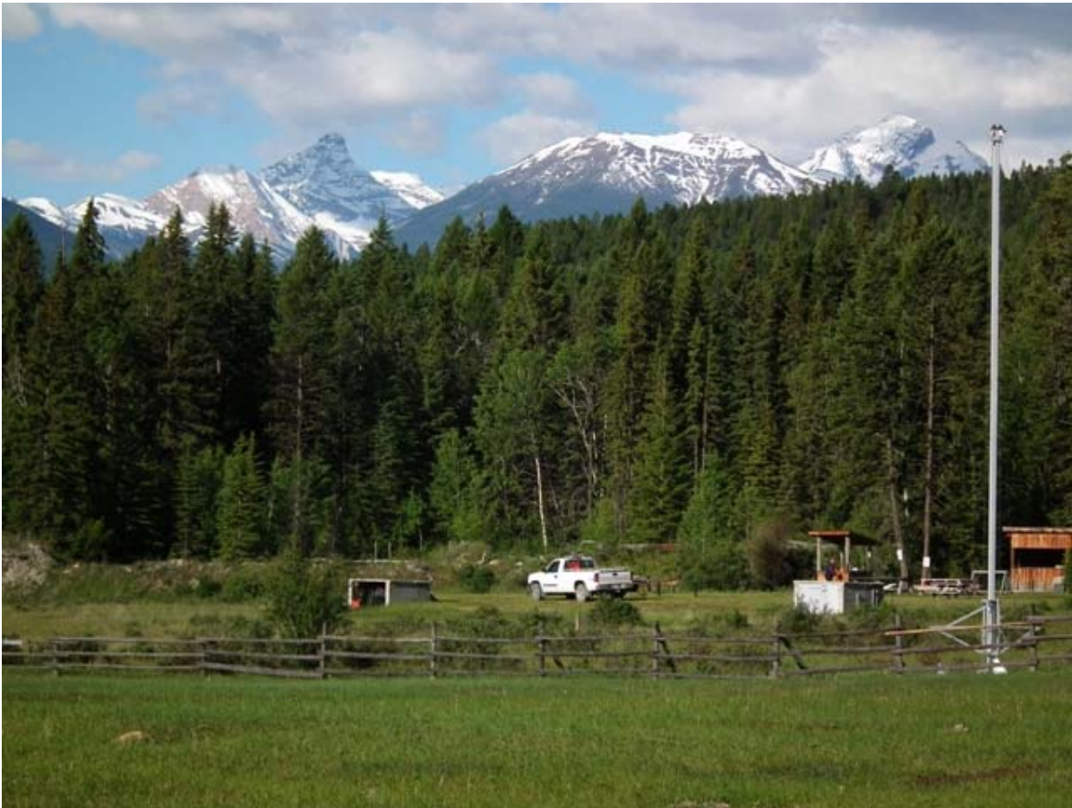
Trap Shooting Area with Purcell Mountains in Background