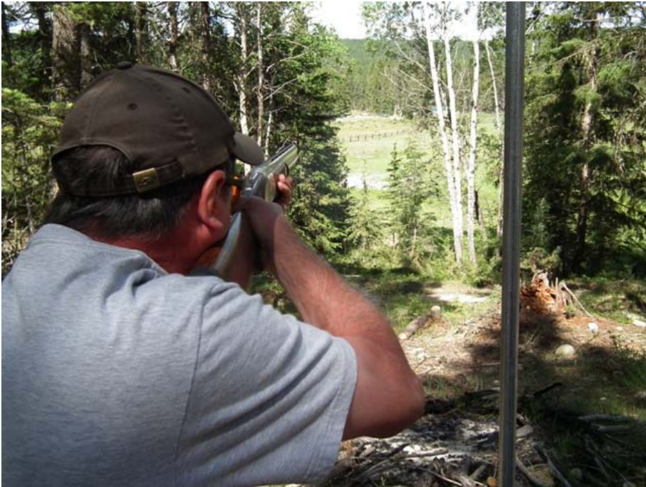
Fast Crosser Through a Narrow Window