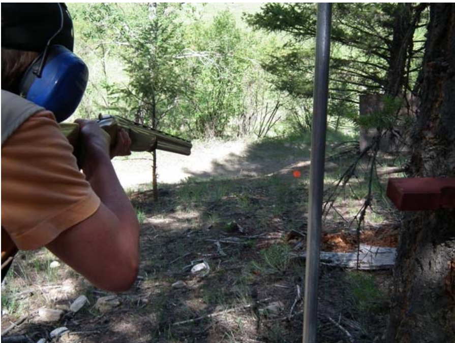
Taking Aim at A Bouncing Bunny