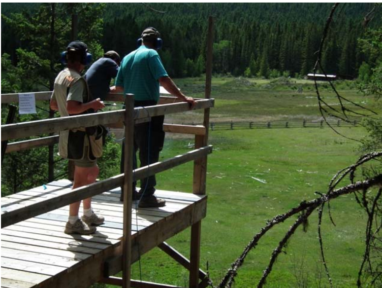
Shooting Down From the Walk Out Station