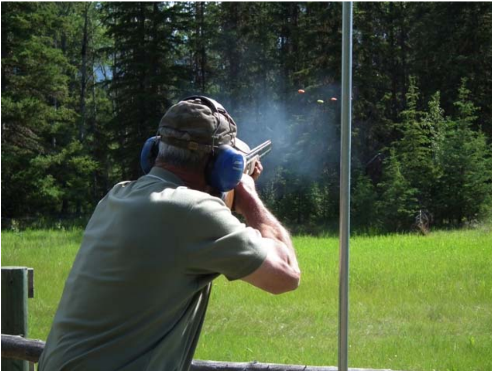
Poison Bird Presentation;- its not a miss, the shot has not yet reached the targets.